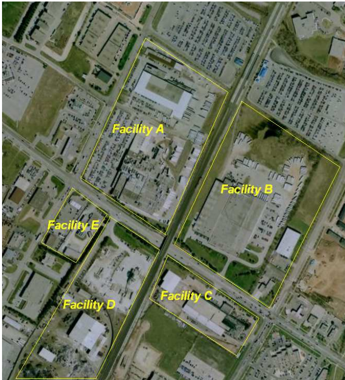
Figure 1 Examples of Adjacent Properties

In order for two or more facilities to be able to be considered adjacent properties under section 4 of Ontario Regulation 419/05: Air Pollution – Local Air Quality (O.Reg. 419/05), the property boundaries for the facilities must be touching each other. Highways, road allowances, railway lines, railway allowances and utility corridors between the properties do not affect the ability of the properties to be considered adjacent. Figure 1 includes examples of properties which are and are not considered adjacent properties.